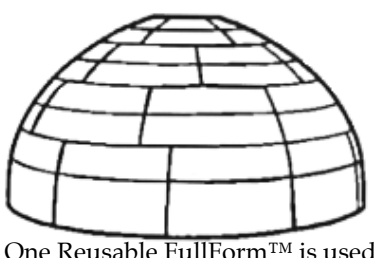
One Reusable FullForm<sup>TM</sup> is used to make this 3-repeat design

360° form embossed and numbered to accept glass placement guides (cartoon)