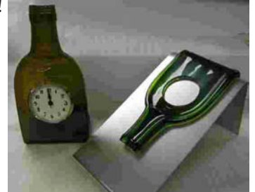
Outstanding Mold Great for larger products