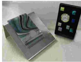
Outstanding Mold Jr. Great for smaller kilns Will work in 11" kilns